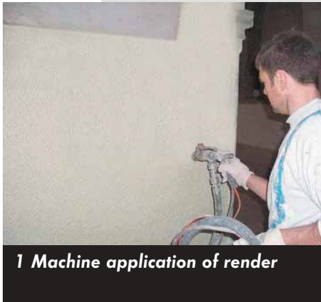
1 Machine application of render