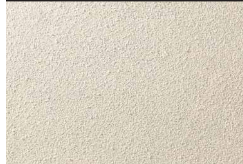
KEIM Universalputz, textured