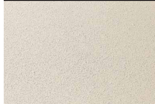
KEIM Universalputz-Fine, textured