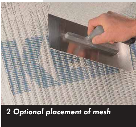
2 Optional placement of mesh