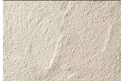
KEIM Universalputz-Fine, felt-floated