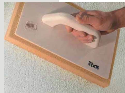
5 Felt-floating with fine sponge float