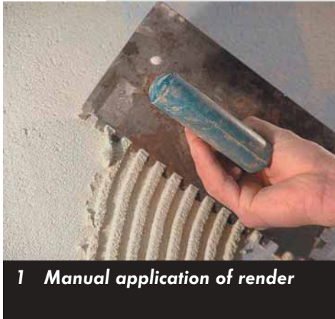
1 Manual application of render