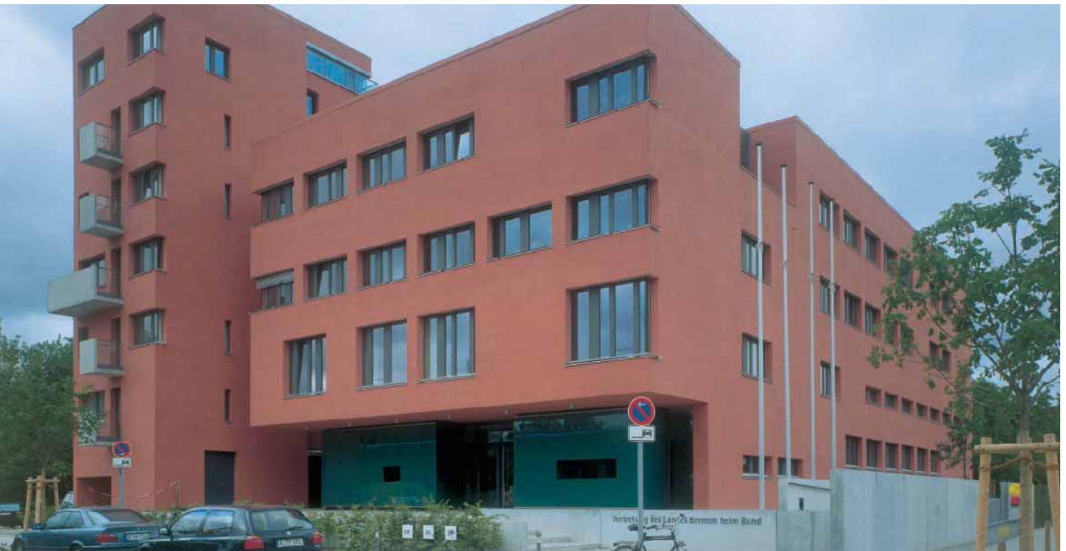
KEIM Granital – the “generation paint”